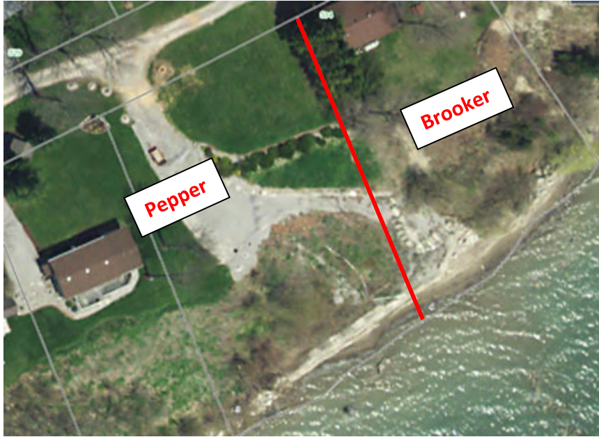
Figure 2: Waterfront Lots owned by parties in 2015 and activity over the top of bank and along the shoreline. 5

The trial judge made findings of fact and referenced the applicable legal principles by quoting from several often-cited cases: